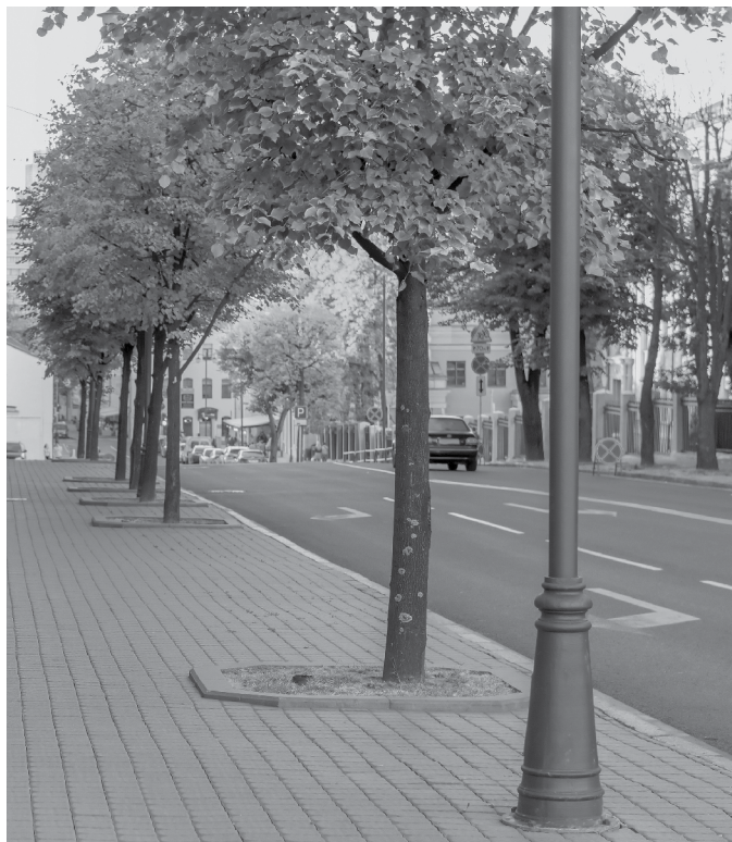
i-Tree Streets is a good choice for helping to build support and enthusiasm for community street trees.

NOTE: It is anticipated that i-Tree Streets and i-Tree Eco may be merged at some point in the future. Other changes and improvements to i-Tree programs are frequently made.