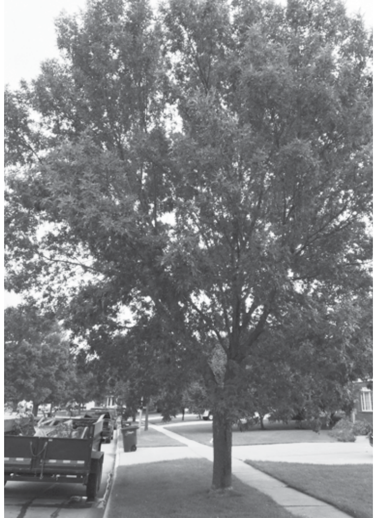
The tree on trial

DEFENSE ATTORNEY: Your honor and members of the jury, there is one key difference from what you just heard and what you'll hear from me. Our defendant, the humble tree, cannot speak for itself. Trees are essential to our well-being. You all have fond memories of growing up around trees, climbing their limbs, and playing in their cool shade. Now science has taken such benefits to the next level, showing that trees provide services that I will explain and that can actually be shown in terms of monetary and environmental value. The prosecution will try to scare you about hazards and responsibilities, but I will show that the nearest homeowner has done everything possible to make this tree safe under normal circumstances and has even agreed to pay for treatment to protect it from the emerald ash borer. I believe you will agree with me that this tree's benefits are greater than the level of risk it affords and that it should not be removed.