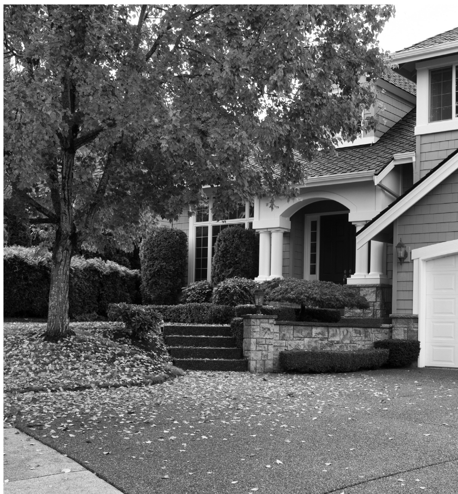
Any arborist or homeowner with a computer can use the National Tree Benefit Calculator, i-Tree Design, or MyTree to make a case for the benefits provided by a single or small group of trees on a property.

There is also i-Tree MyTree, a quicker tool geared toward mobile users that employs the science and processing of i-Tree Design, except that it does not do forward predictions.