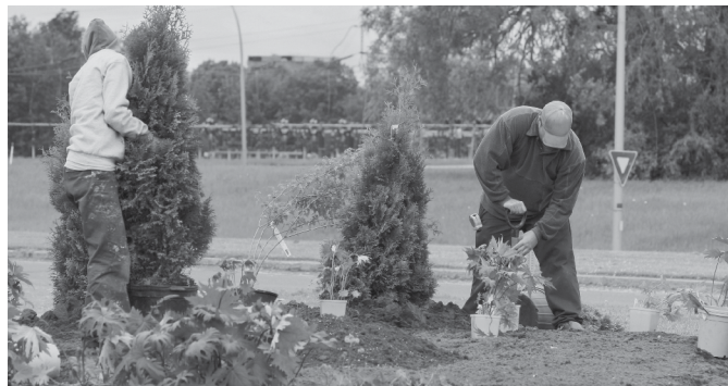
When making tree appraisals, qualified arborists consider the benefits provided by a tree and attempt to place a monetary value that is considered fair to all parties involved.

If the tree is small enough, the value is based on how much it would cost to purchase and install a similar tree. Species, condition, and location of the appraised tree are considered in the calculations used in this method, and removal and cleanup costs can be added into the derived value.