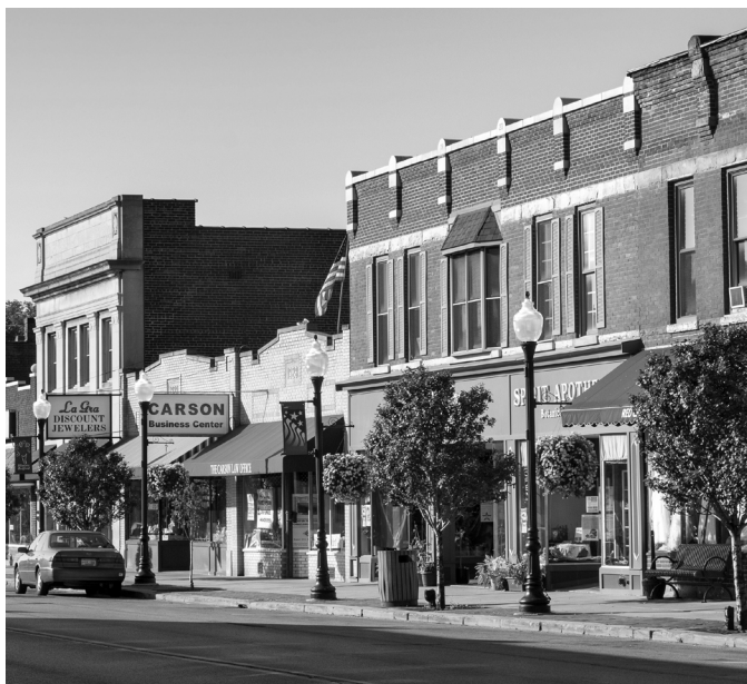
Research shows that trees add important benefits to retail businesses.