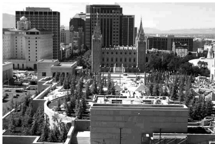
The Church of Jesus Christ of Latter-day Saints Conference Center roof and terraces in downtown Salt Lake City, Utah, provide environmental benefits as well as a showcase for visitors. Diverse vegetation was planted on top

Green roofs can be designed to fit all circumstances. Some are accessible for use by residents or visitors. Ecoroofs are designed especially to be lightweight, use shallow soil, and be low maintenance and self-sustaining. All make good use of small spaces and make a contribution to better living in urban environments.